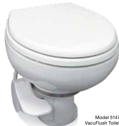
Model 5147 VacuFlush Toilet

Specifications subject to change without notice.