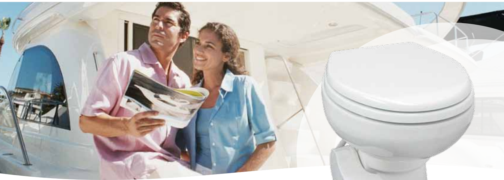
Model 5009 VacuFlush Toilet

Compact design. Powerful, efficient flush.